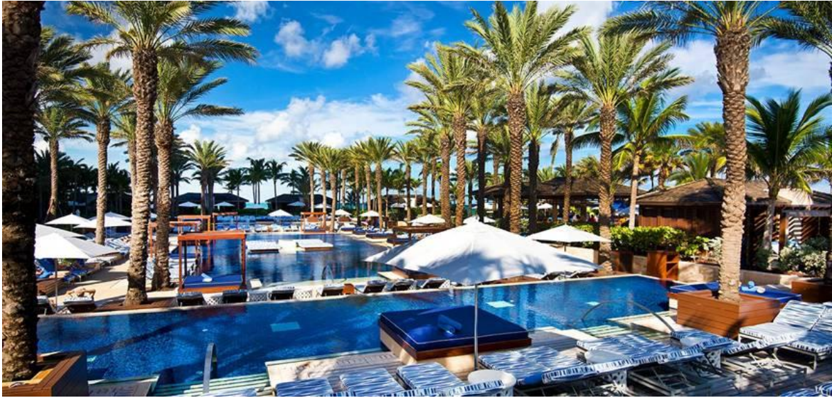
The redesigned adult only Cove Pools at The Cove Atlantis